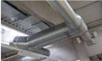
Mechanical / Plumbing