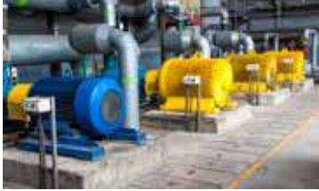
Plant / Equipment Installation