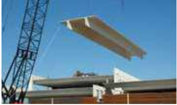
Prefabricated / Modular